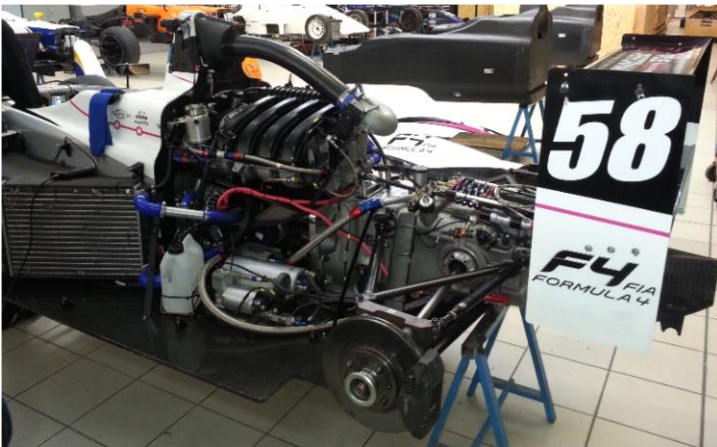
Fitting the Renault F4 engine in the Mygale chassis.

Mygale and Renault Sport are working together to create the very first 100% French Mygale F4, Made in Magny-Cours.